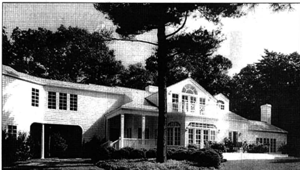
THIS DRESSY Shingle Style house deep in Northwest began as a builder's cottage and is now an art showcase for the owners of the Lizan Tops Gallery.