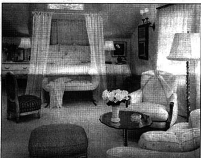
THE MASTER BEDROOM suite, with its off-white and silver palette, is the only subdued room in the house.